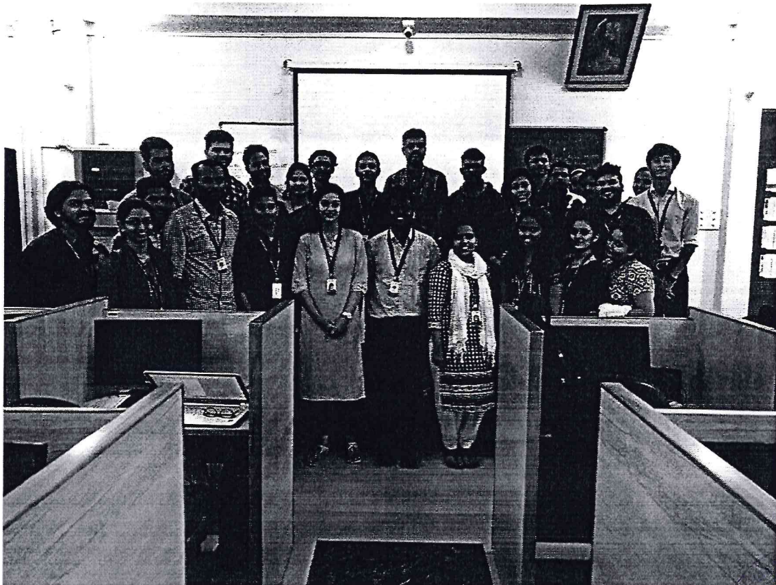
MEDIA AND MARKETING WING (2017-18)