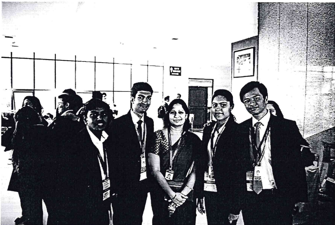
MEDIA AND MARKETING WING (2017-18)

Students were also provided with the certificates after the successful completion of workshop.